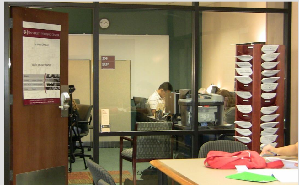
West Campus Library Room 205