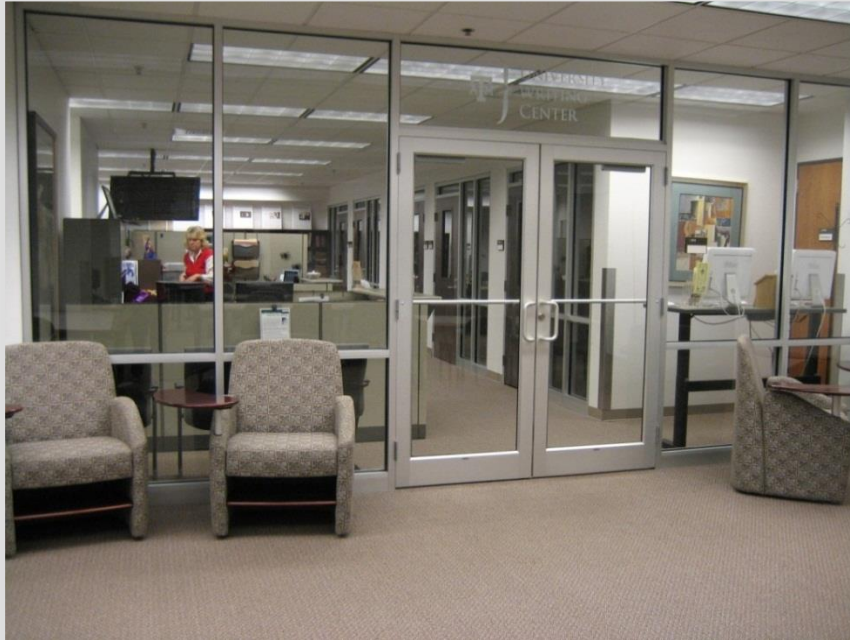
Evans Library Room 214