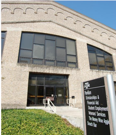
The Pavilion Veteran Services Office