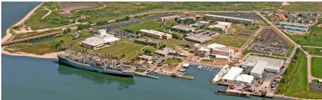
Texas A&M University at Galveston